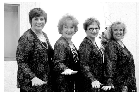
Just Jammin Quartet