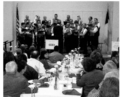
Victoria Barbershop Mens Chorus

A number of individuals made cash contributions or contributed through program ads and in-kind donations. The Food Bank is grateful to each and everyone that made the 2010 Valentine’s Dinner a success.