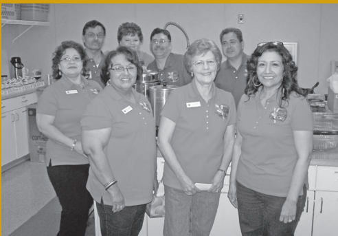
2010 Agency Staff 2010 Agency Relations Conference (see pg. 4)